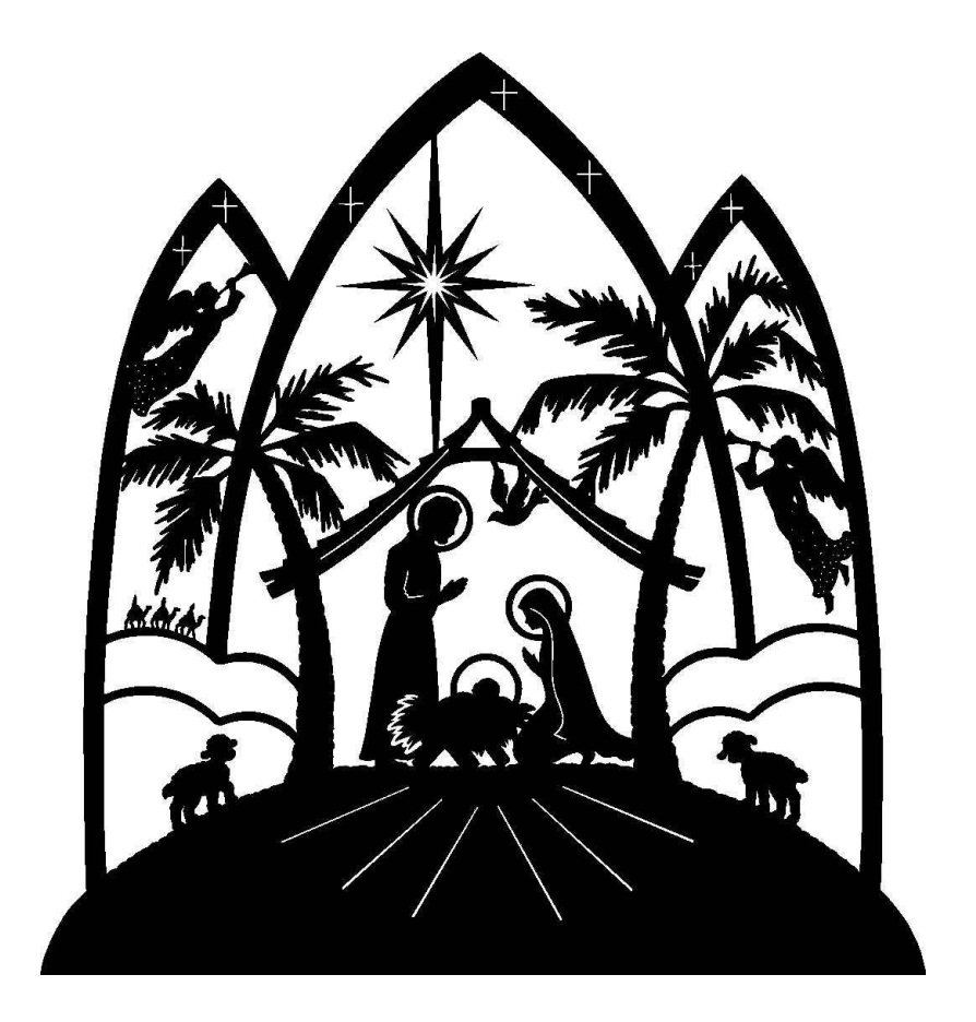
Dec. 9<sup>th</sup> 2020 Immanuel Lutheran Church