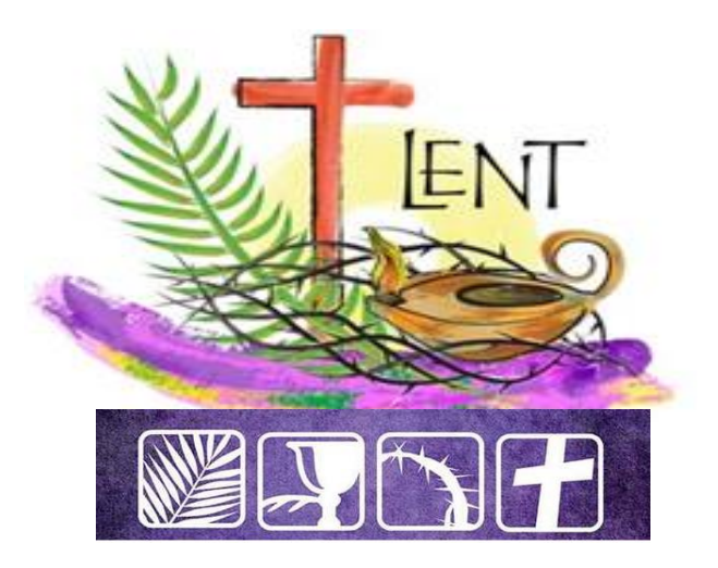
Fífth Sunday ín Lent

Whether you are a lifelong member or visiting for the first time we are honored to have you here this morning. Please feel free to contact the office regarding questions of membership or of a spiritual or personal matter. You may contact the office at: 660-335-4141 . If you get a chance check us out online at: