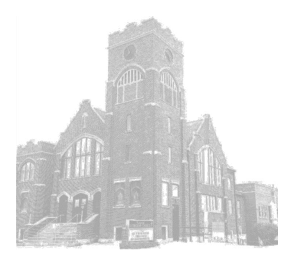
The Fourth Sunday in Lent March 30th, 2025

To God be glory for 146 years of His grace at Immanuel and 74 years of proclaiming Jesus on our radio broadcast!